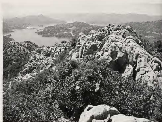
FIG. 5. Limestone outcrop habitat for Erythronium shastense , with Shasta Lake in the background.

Like E. helenae (Applegate 1933), E. shastense can form clumps due to bulb offsets (bead-like tissues arising from the bulb). This adaptation is well suited for taxa that tend to grow in rocky conditions with little soil development. Zonal soil development in such rocky habitats is limited; vascular plant establishment is restricted to cracks, fissures or solution pockets in limestone where organic matter accumulates, and where